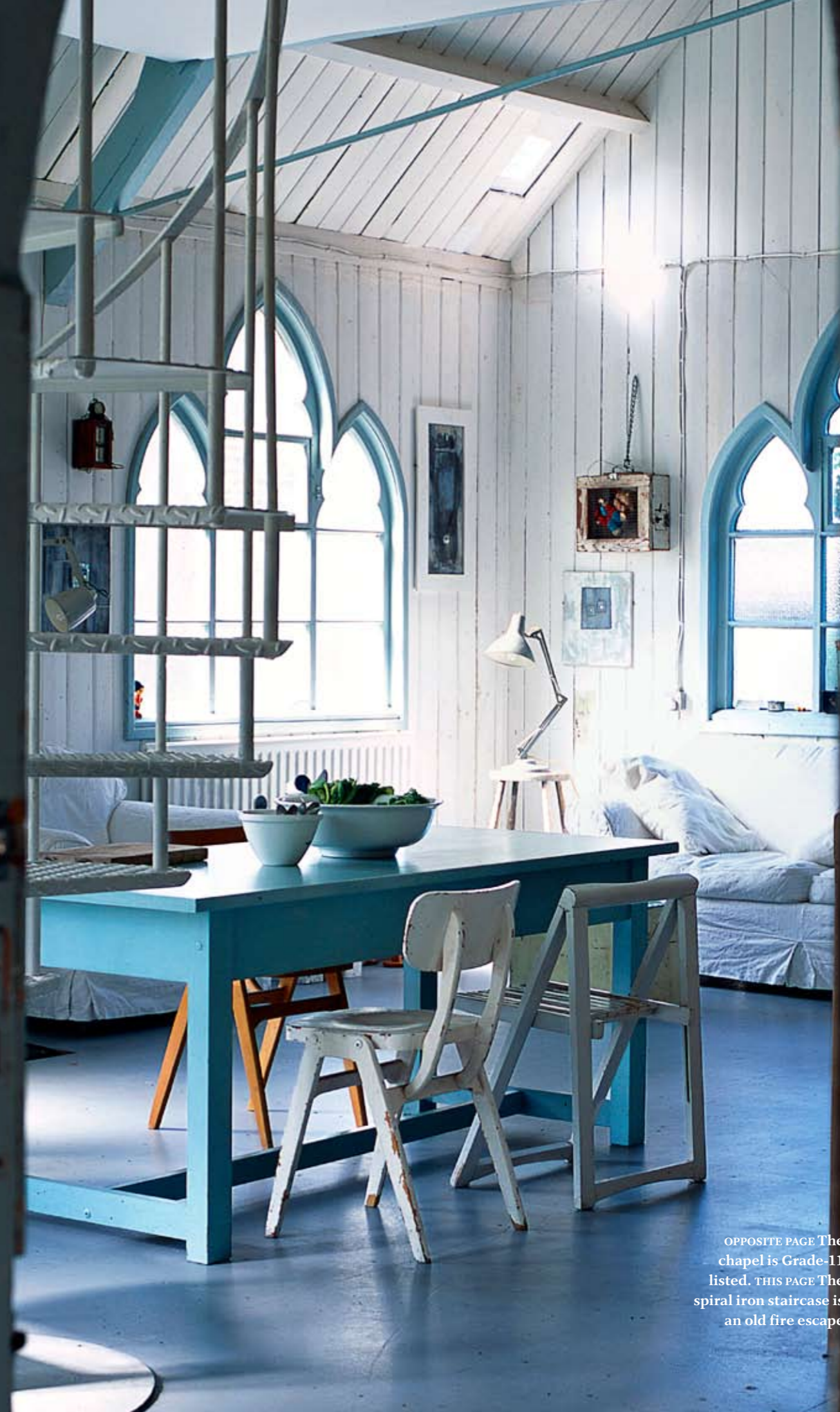
OPPOSITE PAGE The chapel is Grade-II listed. THIS PAGE The spiral iron staircase is an old fire escape